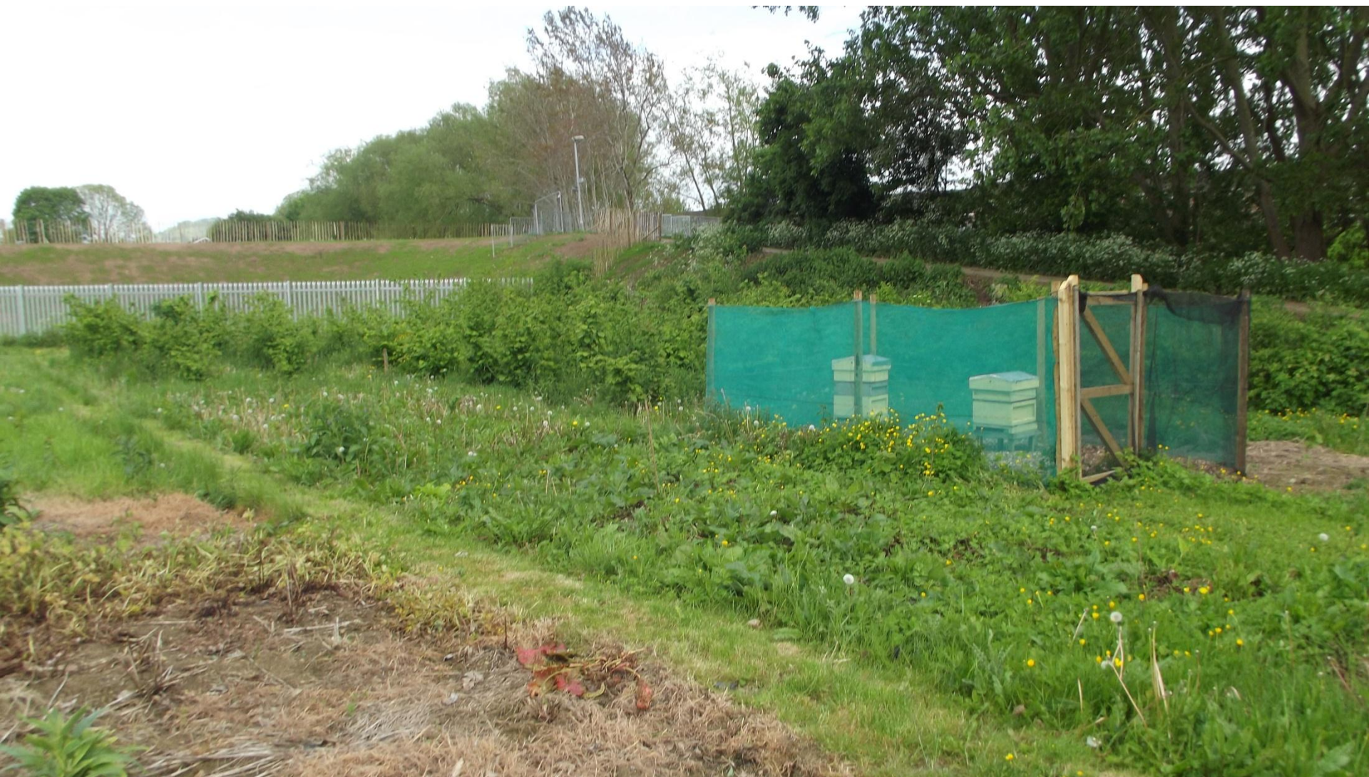
Hazel coppice and area for honey bees located in an unproductive area of the site (May 2014)