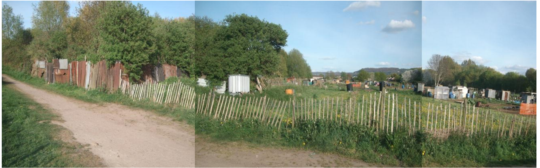
Old piggery and abandoned plots (April 2012)