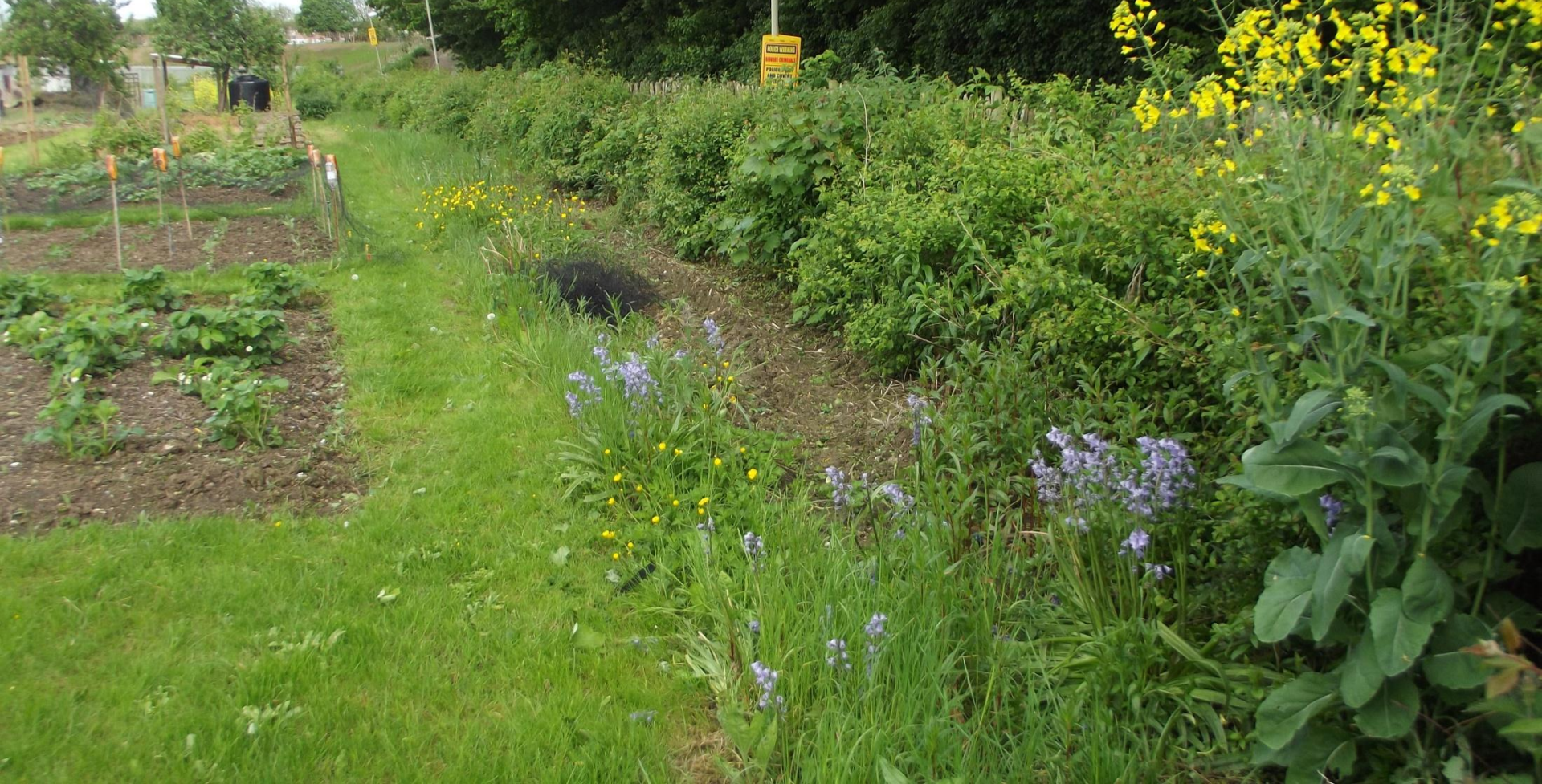
Established hedgerow (May 2014)