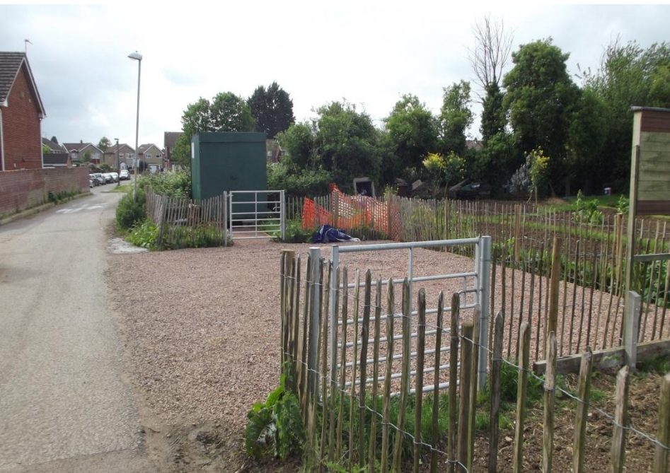
Drainage works and installation of shipping container storage for FOSP with hard standing car park (August 2013)