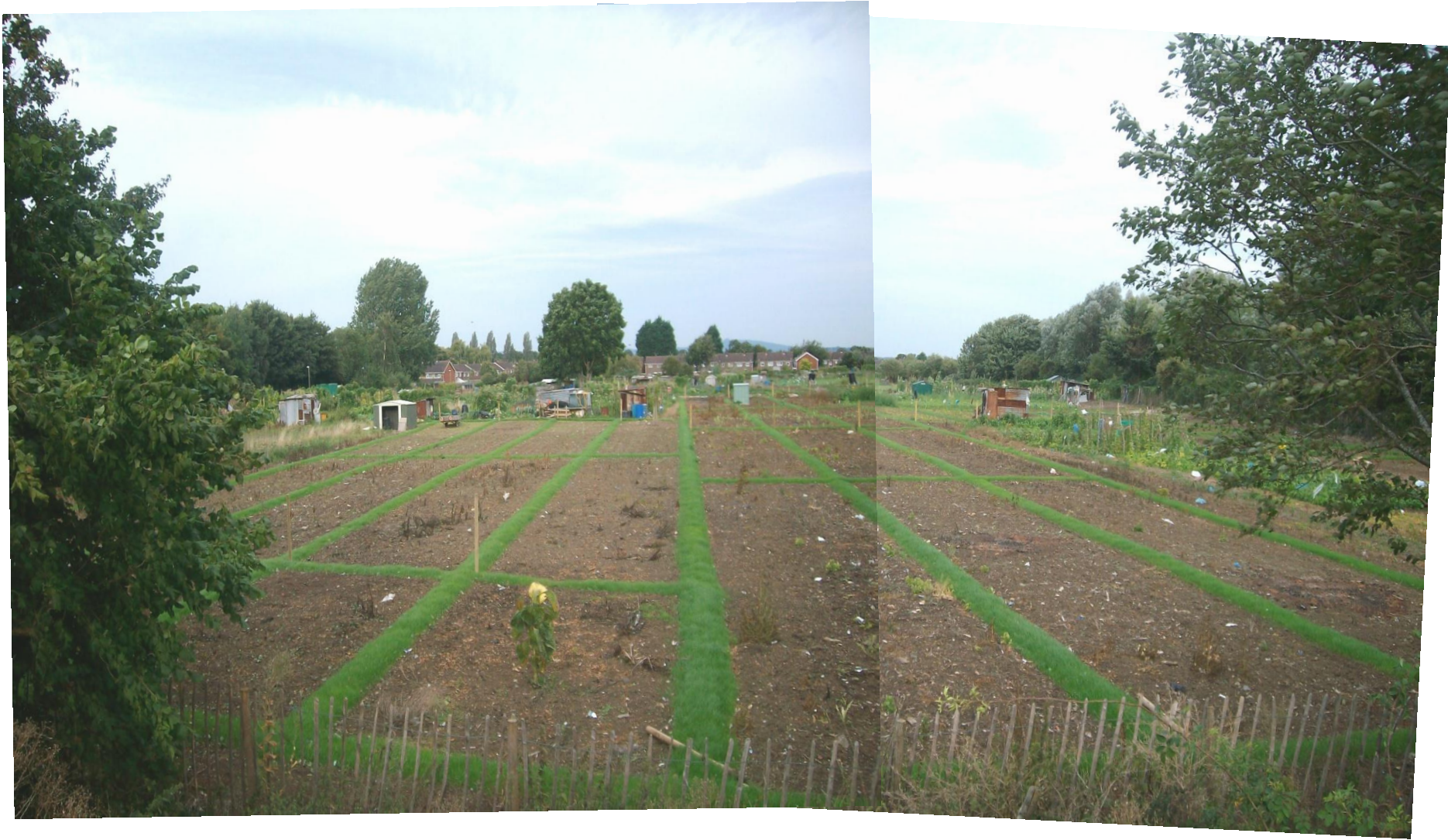
Newly reinstated plots (September 2010)