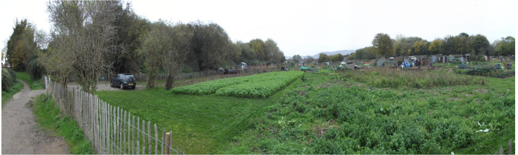
Old piggery site converted to hard standing car parking and reinstated plots sown to mustard green manure (October 2013)