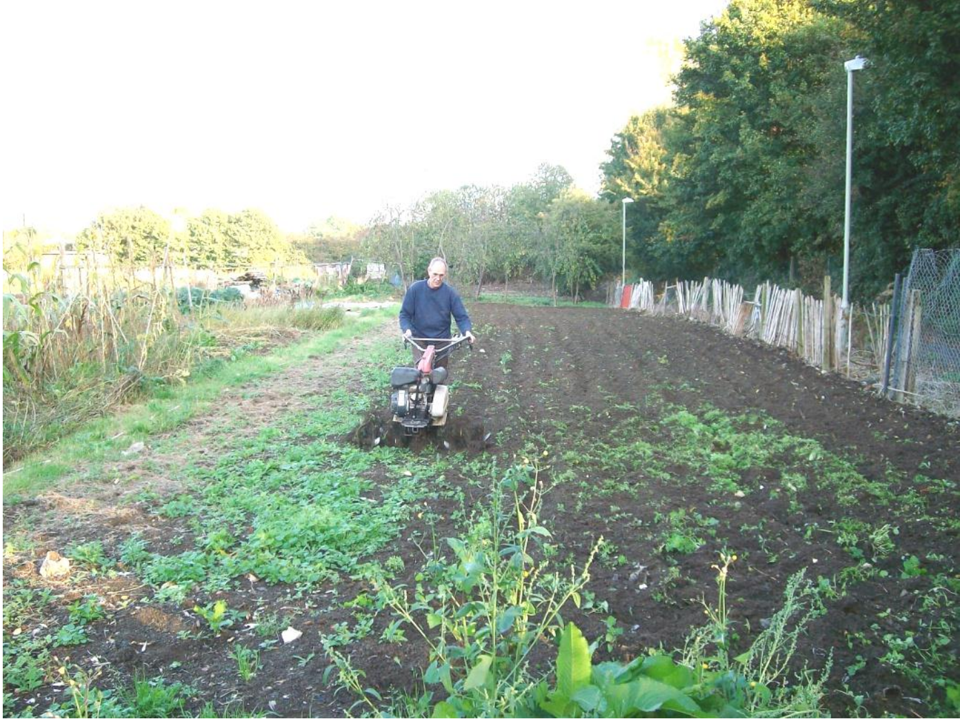
Bare fallow weed control